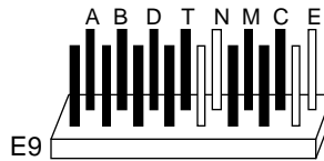
Figure 5: Header E9 selection (shown set in factory default)

Set jumper to “A: to enable the DMA channel selected on E15. Jumper “B” enables the DMA channel selected on E16. Note that E15 corresponds to the 8530 signal WAIT/REQ and can be used for transmit or receive DMA transfers only. Jumper E16 corresponds to the 8530 signal DTR/WAIT and can be used for transmit DMA transfers only. If you are using the ACB6 in a full duplex DMA situation, set the transmit DMA channel on jumper E16 and the receive DMA channel on jumper E15. Removing the “A” and the “B” jumper will disable both DMA channels.